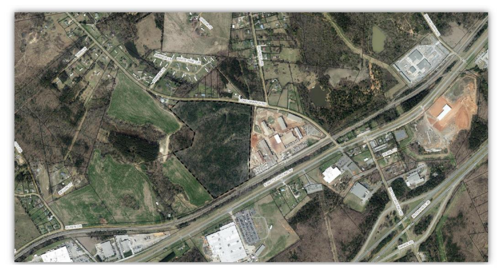
CASE # 22-01 Rezoning Light Industrial to Heavy Industrial Property Location: 1572 Long Branch Road Parcel Number: 10480 Acreage: 41.94

Property Location: 1572 Long Branch Road Parcel Number: 10480 Acreage: 41.94